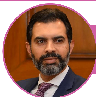
Governor, State Bank of Pakistan Dr. Reza Baqir