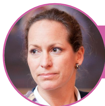
Director, Aga Khan Development Network Princess Zahra Aga Khan

Reducing the Gender Gap in Financial Inclusion